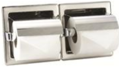
AIE320C Bright finish

Dual roll toilet tissue dispenser / Recessed