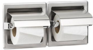
AIE320CS Satin finish