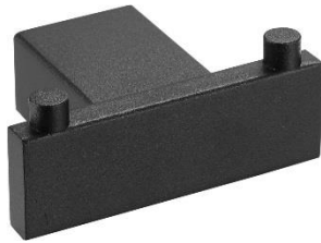
AI2418B Black finish