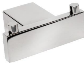
AI2418C Bright finish