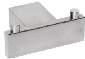
AI2418CS Satin finish