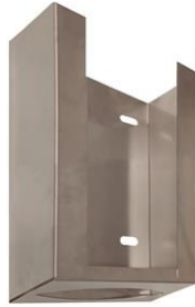
DTM2106 AISI 304 stainless steel