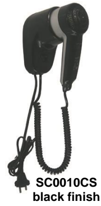
SC0010CS black finish