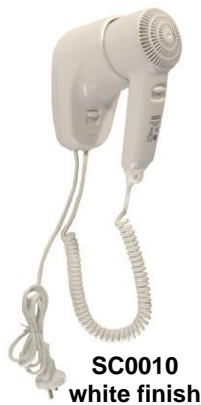
SC0010 white finish