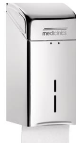
DTH100C Bright finish