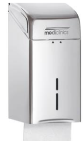
DTH100CS Satin finish