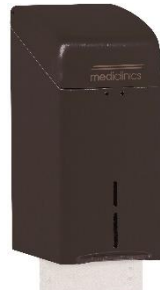
DTH100B Matte black finish