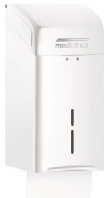
DTH100 White finish