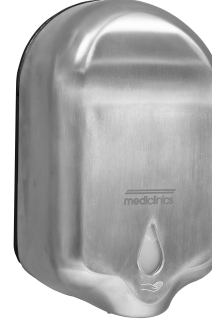
DJ0050ACS Bright finish