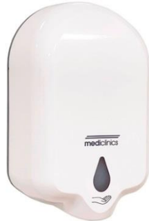
DJ0050A White finish