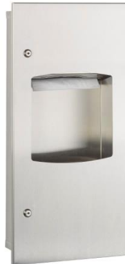
DTE0030CS finish satin