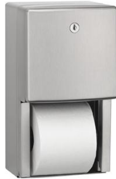
PR0700CS Satin finish