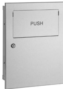
PPE0035CS Satin finish