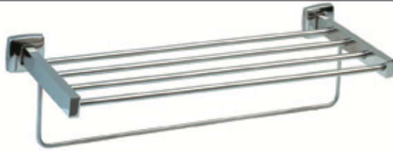
AI0710C Bright finish