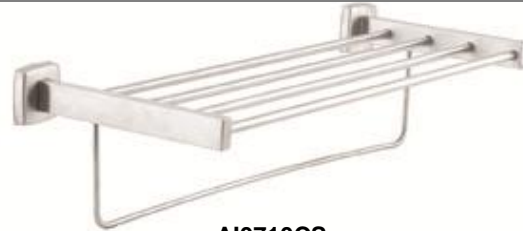
AI0710CS Satin finish