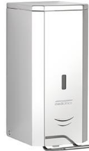
DJSP036C Bright finish