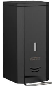
DJSP036B Matte black epoxy finish