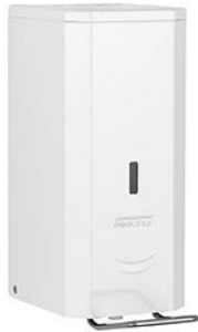
DJSP036 White epoxy finish