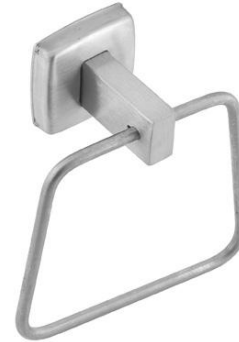
AI0115CS Satin finish