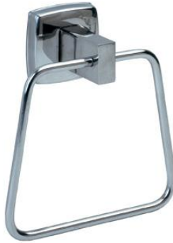
AI0115C Bright finish