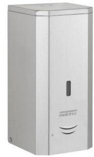
DJ0037ACS Satin finish