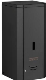
DJ0037AB Matte black epoxy finish