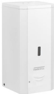
DJ0037A White epoxy finish