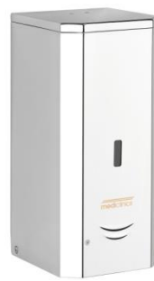
DJ0037AC Bright finish