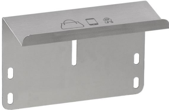
RPR2700CS Satin finish

Shelf for industrial paper roll dispensers to place small objects