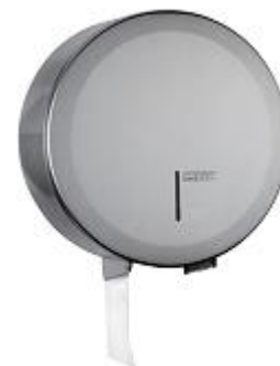
PR2787CS Satin finish