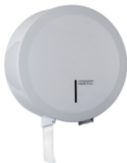
PR2787 White epoxy finish