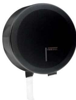
PR2787B Black epoxy finish