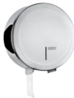
PR2787C Bright finish