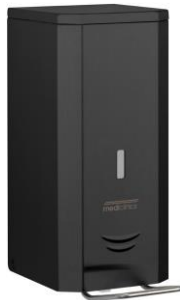
DJFP035B Matte black epoxy finish