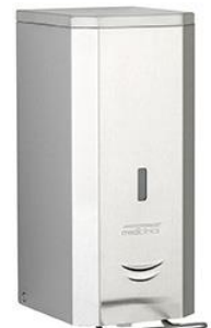
DJFP035CS Satin finish