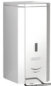
DJFP035C Bright finish